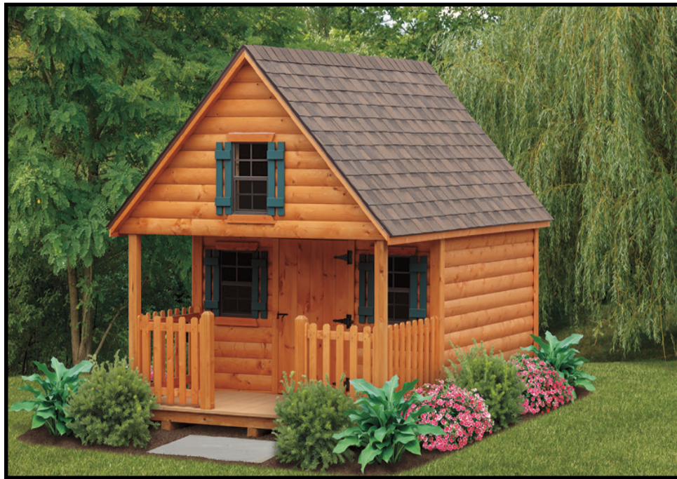
Hideout Playhouse with Loft over Porch