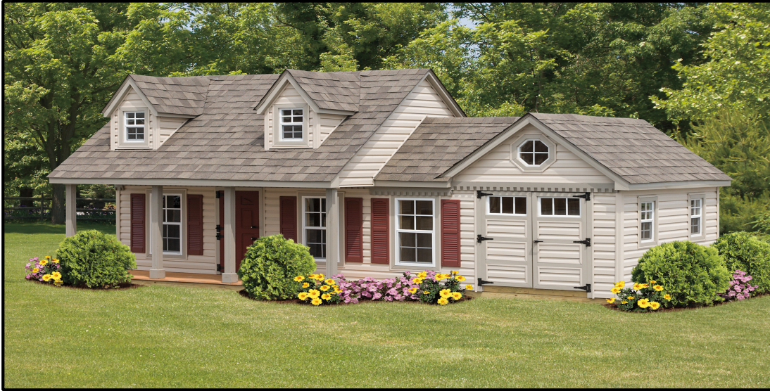
New England Vinyl Playhouse shown with Optional Garage & Breezeway